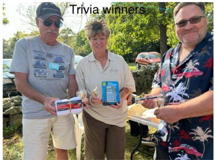
Thunderbird Celebrity Quiz Winners