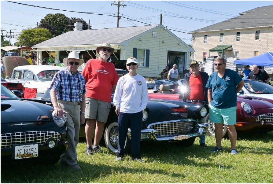
The Gangs All Here