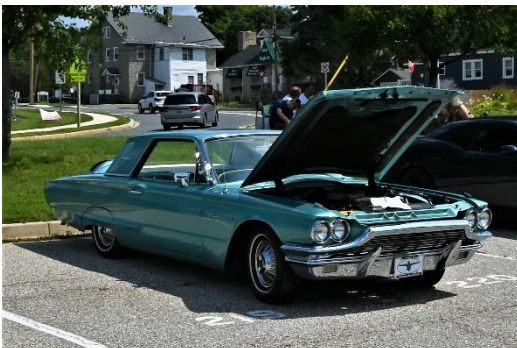
Dan Luber's '64