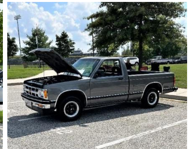
Guess Who Brought This?