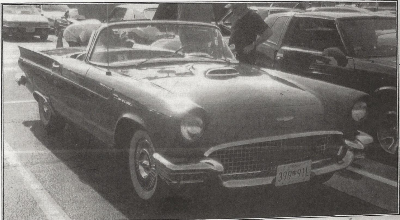
The '57 T-Bird before the accident at a local show.