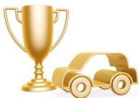
Tom Young, 3 rd Place, 1955-57 Thunderbird