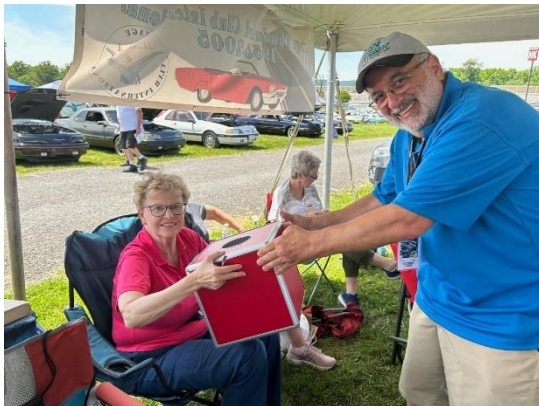
TBird Trivia Quiz Award Winner