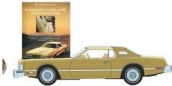
39150E - 1:64 1976 Ford Thunderbird "Treat Yourself to One of the World's Great Luxury Car Buys"

These are 1:64 scale produced by Greenlight. Price will be about $7.00 each. I expect to have them available mid-year.