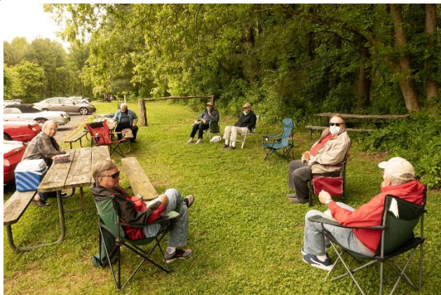
Ladies segregated .....From the Men