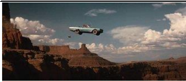
Thelma & Louise TBird Collectible Models Coming Late 2021