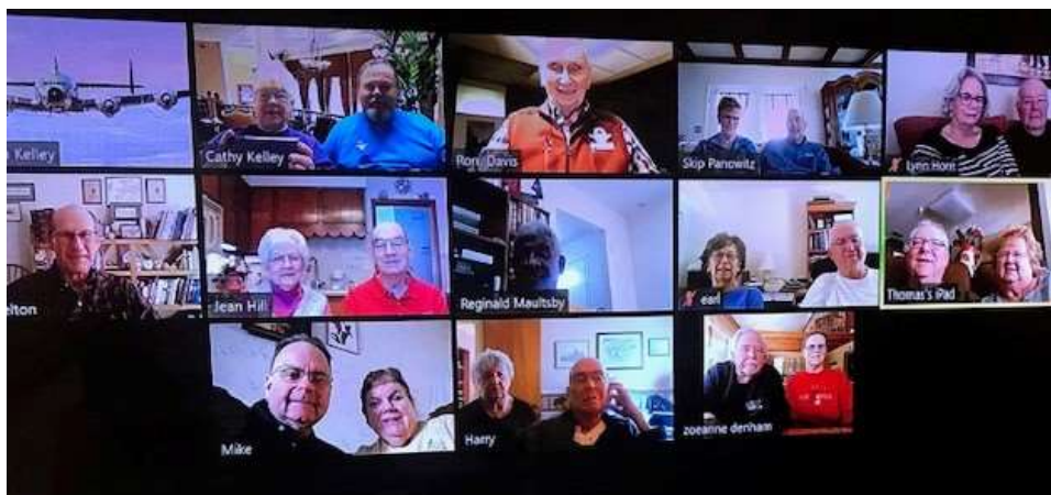
February 2021 "Kick-OFF" Zoom Meeting

Note: The calendar includes prospective events based on prior year calendar input and activities. Those that are not certain are listed as dates TBD. The calendar will be revised to add specific details, or the event deleted, as applicable. As always, we welcome information on new events and activities to add to the calendar.